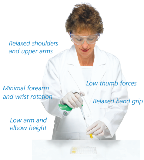
Ovation's "low profile" also allows better visibility for acquiring tips, and guiding tips into small vessels such as microtubes.

Ovation is a whole new class of pipette – not an old design with minor improvements. Its innovative shape naturally follows the contours of the palm, and allows all pipetting steps to be performed with neutral postures, minimal muscular movements, and low hand and arm elevations. Best of all, Ovation is the most comfortable, easy-to-use pipette you will ever experience.